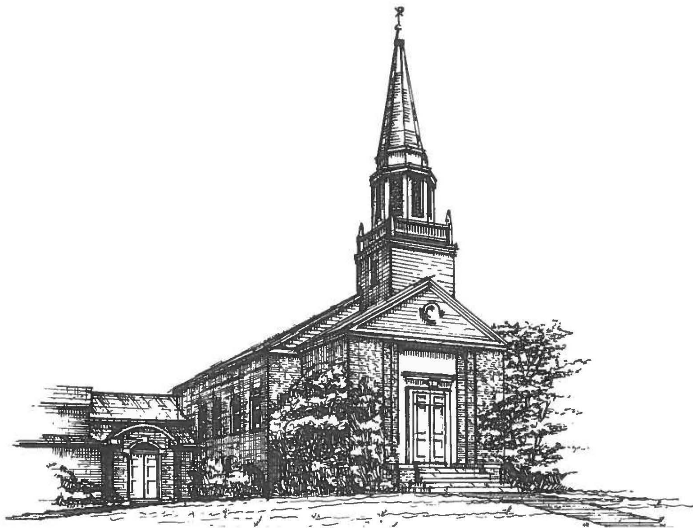
North Haven Congregational Church

Presented At The Annual Meeting January 25, 2026