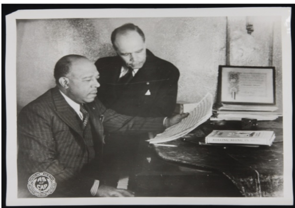
James Weldon Johnson, left, and J. Rosamond Johnson at the piano.

To me, this song fits perfectly with other nationally recognized songs along the lines of “God Bless America” and “America the Beautiful”. I am grateful that many hymnals (since the 1980s) have chosen to publish it and that it is getting wider press. If Americans (of all political persuasions) do their research, they will see that Lift Every Voice and Sing is something for all of us to be proud of, and it articulates poetically a story of our people that needs to be told.