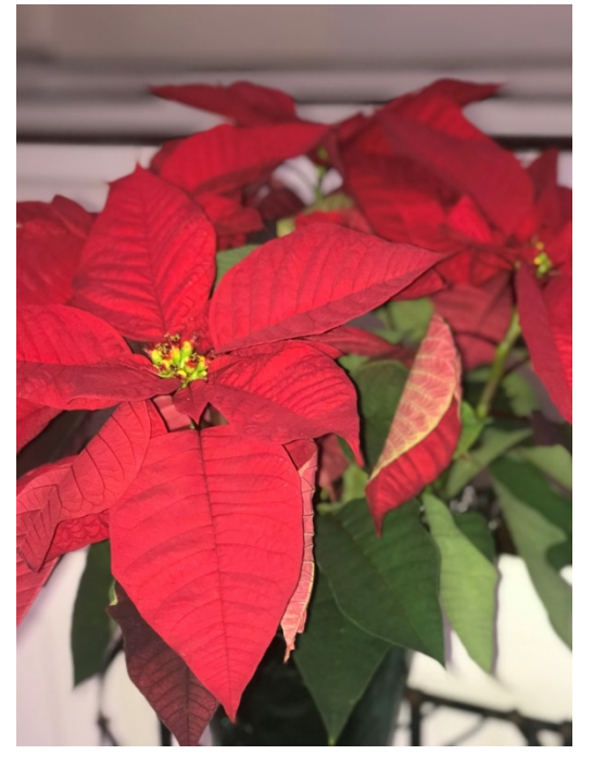
Donations Provided By