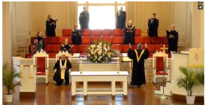
The choir of the Myrtle Beach Presbyterian Church spreading out to perform for an online service. Myrtle Beach Presbyterian Church

It's exciting to imagine getting together in a group and singing our favorite hymns, and recording them in the special space that we are used to singing them in.