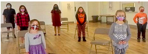
Seek Ye First the Kingdom of God