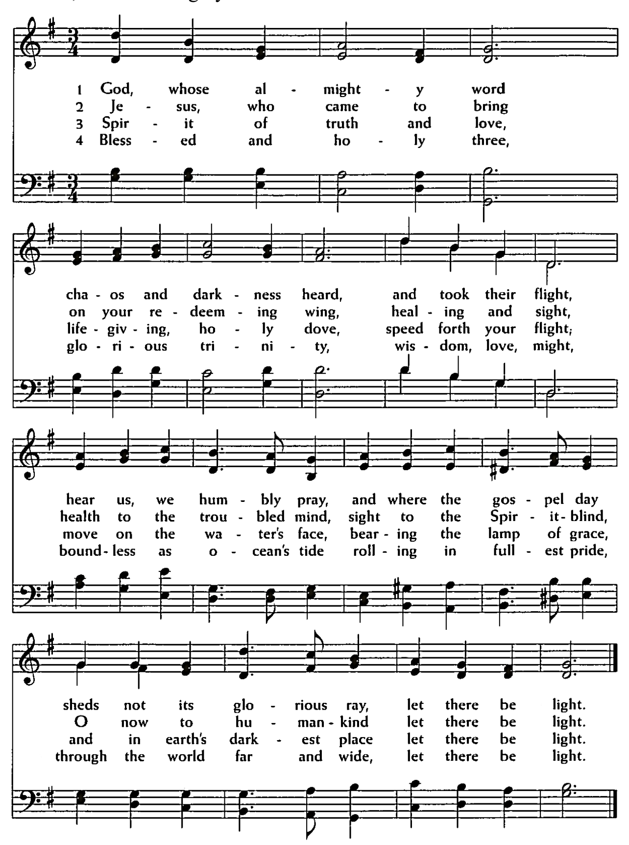
*HYMN: "God, Whose Almighty Word"