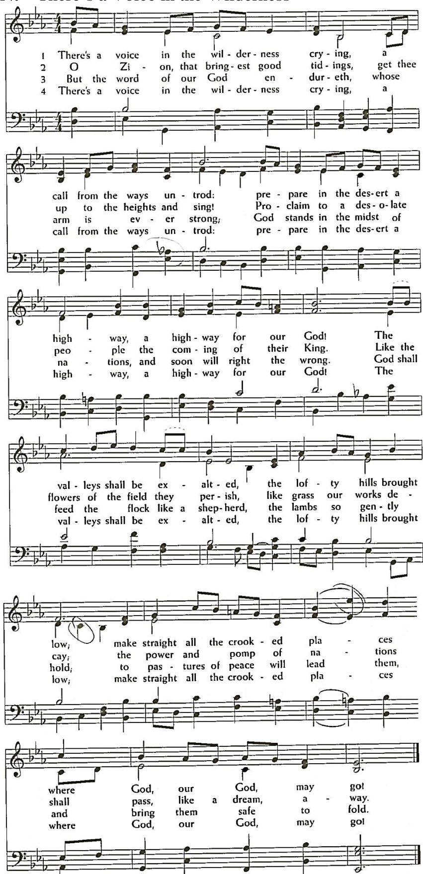
*CLOSING HYMN: "There's a Voice in the Wilderness"