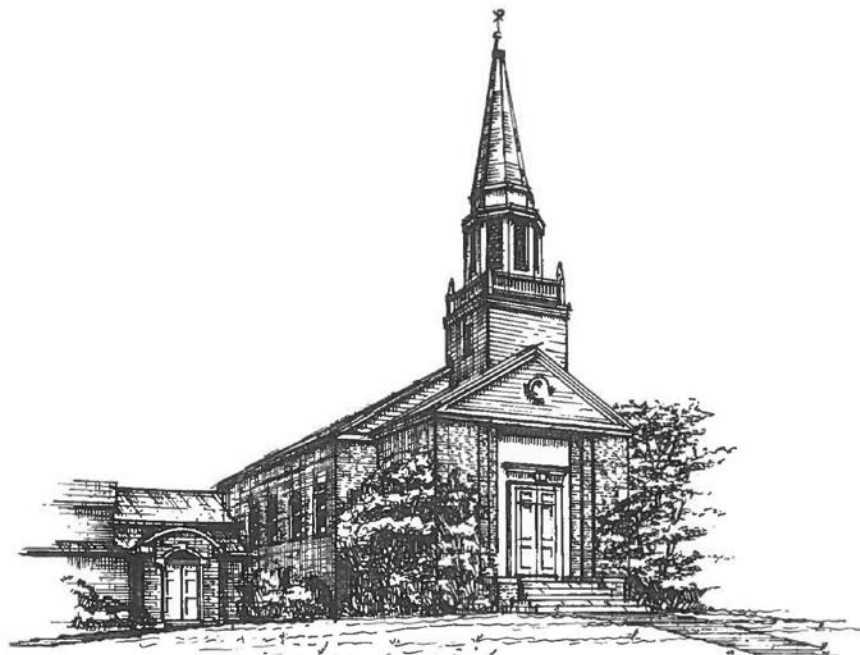
North Haven Congregational Church

Presented At The Annual Meeting February 2, 2020