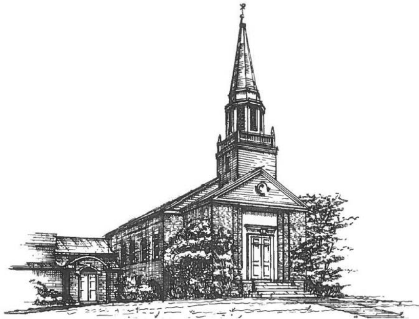
North Haven Congregational Church

Presented At The Annual Meeting January 21, 2018